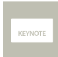
Keynote Patron Card