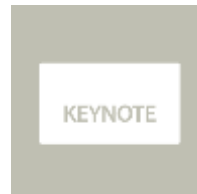
Keynote Patron Card