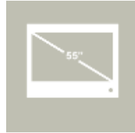
LCDs in Lobby